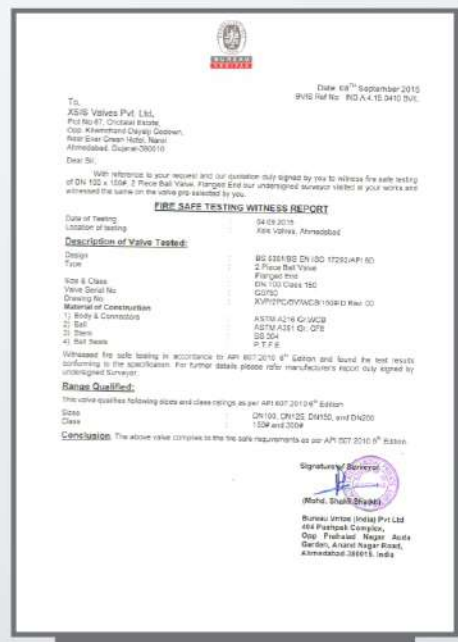
FIRE SAFE CERTIFICATE